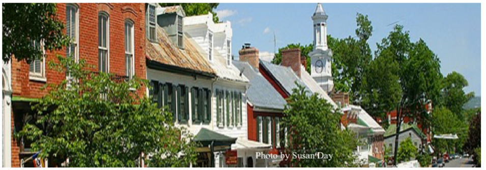
beautiful, historic Shepherdstown